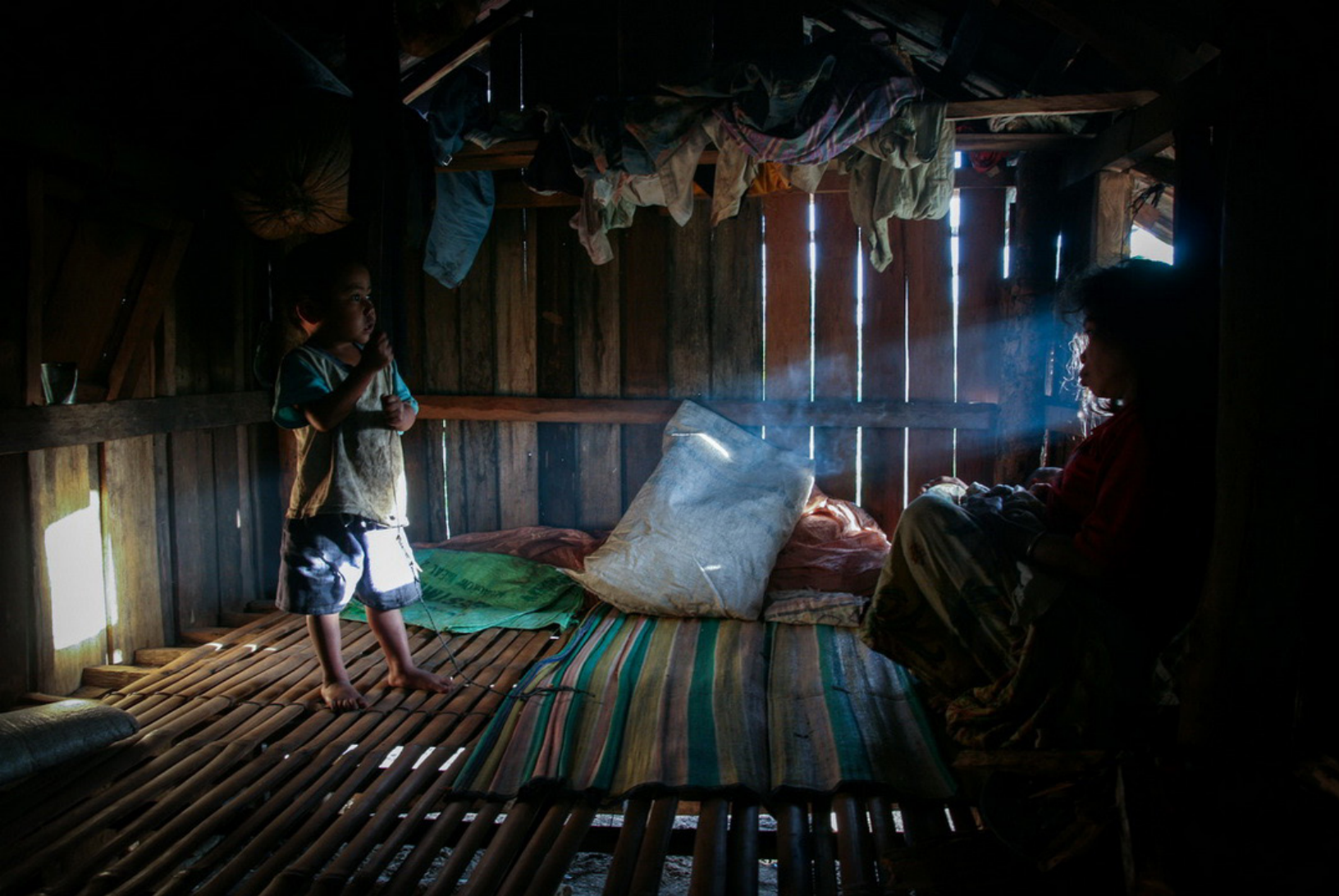
A mother and child inside their house.